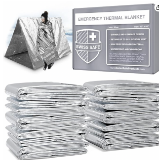
Emergency Blanket x 1