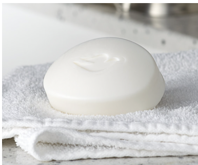
Soap Bar x 3