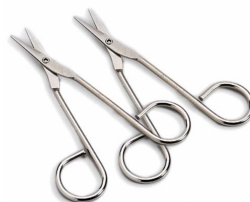
Scissors x 1