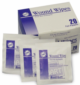
Antiseptic Wipes x 10