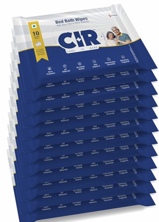
Packet of 10 Wipes x 3