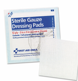
Gauze Pad x 10