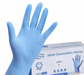
Gloves x 1