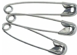
Safety Pins x 10