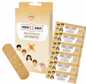
Band-aids x 10