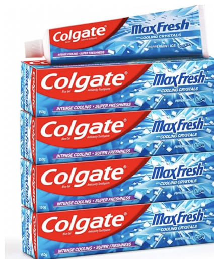
Toothpaste x 1